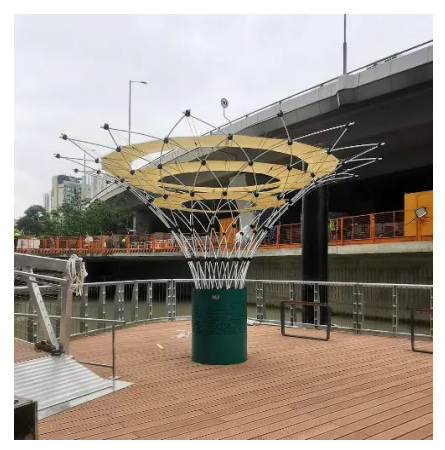
Atlantis Station Park - China