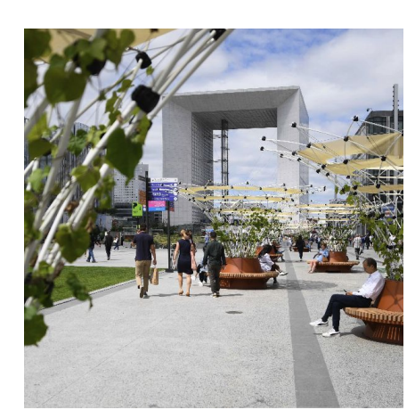
Paris La Defense - France youtube.com/watch?v=Qt-DKkOrFN4