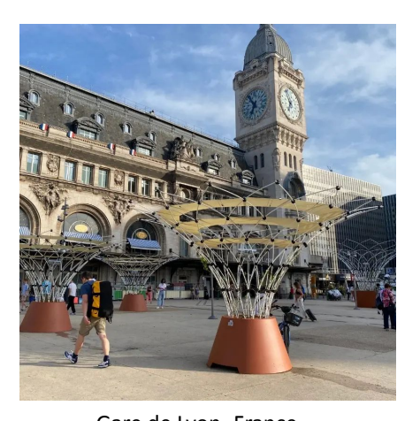
Gare de Lyon- France youtube.com/watch?v=DMNAtQikaeo